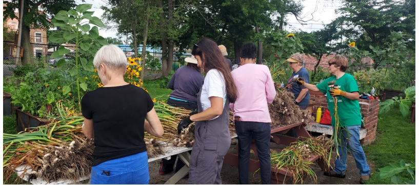
Master Gardeners volunteering at Farm City Detroit.