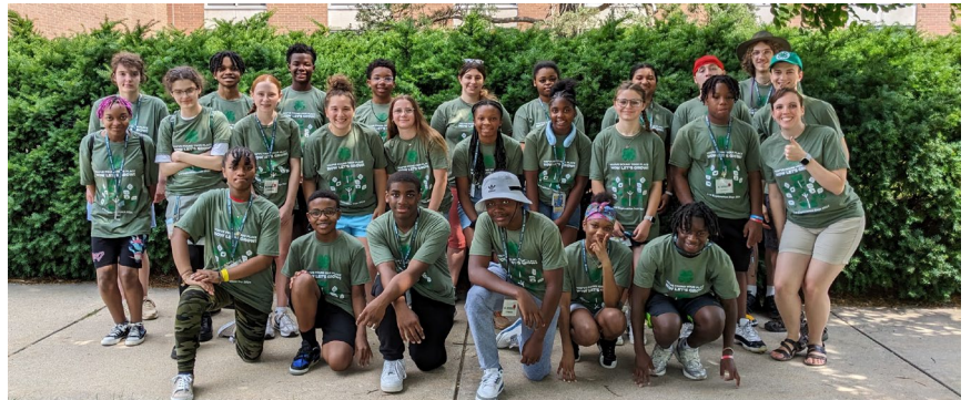
Wayne County 4-H members engaged in hands-on learning and leadership activities during the 2024 4-H Exploration Days at Michigan State University.