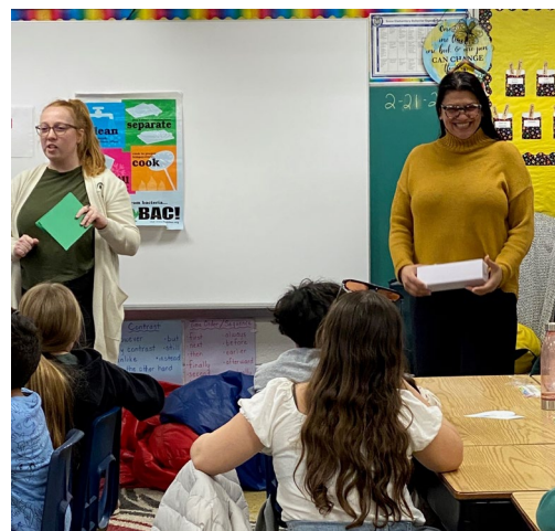
United States Representative Rashida Tlaib visits a class at Snow Elementary in Dearborn with an MSU Extension community nutrition instructor to see MSU Extension programs in action as well as to learn more about how our programs impact our communities.

MSU Extension continued to create more programs and opportunities for learning while fostering public interests in healthy lifestyles, child development, homeownership and money management, cultivating sustainable agriculture and building a strong future for our youth. Our MSU Product Center innovation staff member supported 120 clients and generated more than 1,000 hours of counseling individuals in starting, managing, and growing food-based businesses in Wayne County. Her efforts informed individuals as they made strategic decisions about the use of their personal resources as they pursued their passion in entrepreneurship.