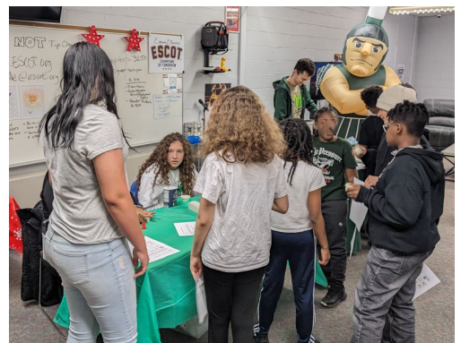
4-H Family Game Night at Emanuel Stewards Champions of Tomorrow (ESCOT) Youth Development.