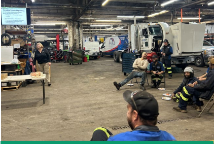
Budgeting and spending workshop by Extension educator at Kerry Brothers Truck Repair.