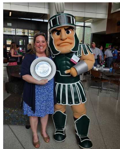
Wayne County 4-H educator accepting the MSU Extension Excellence in Teaching Award for 2024.

Lawn and Garden Hotline 1-888-678-3464 www.canr.msu.edu/outreach/ask-an-expert