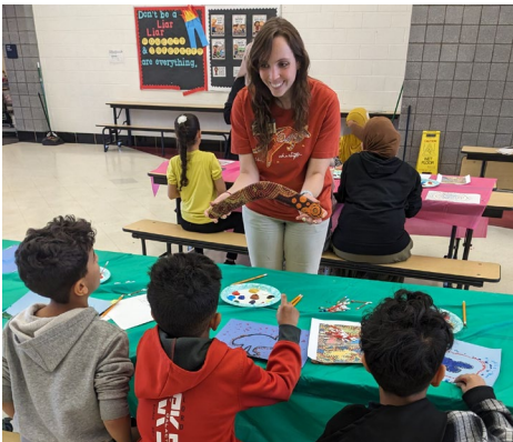
A 4-H program coordinator showcases an authentic Aboriginal Australian boomerang, adorned with traditional dot art, during the 'Crafts Around the World' event at Oakman Elementary.