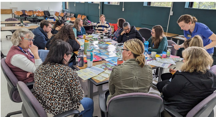
Extension and Michigan Sea Grant educator hosting Watershed Game training at Focus Hope.