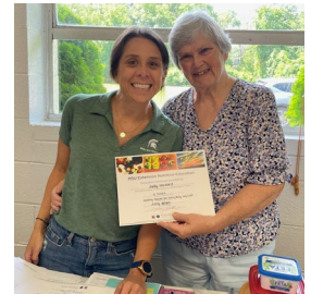
MSU Extension community nutrition instructor and a graduating participant.